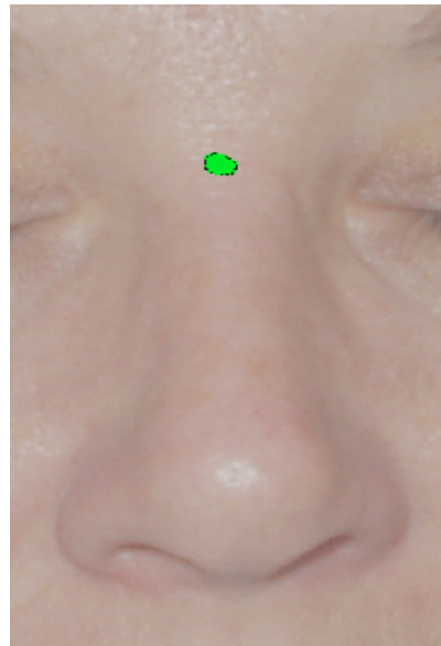
For the Nasion mark the lowest indentation above the crown on the nose as shown here.